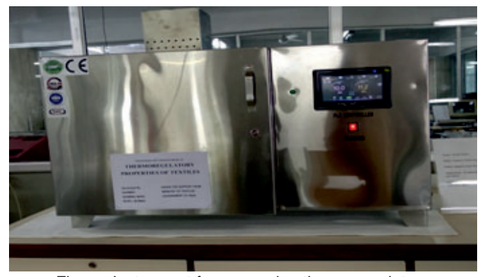
Figure: Instrument for measuring thermoregulatory property of textiles

There are few fabrics available in the market which can control the body temperature and keep the wearer cool in a hot weather or warm in an extremely cold weather. Some fabric manufacturers claims that their innovative fabric can reduce the body temperature by around 10-15 °C. But before this project, there was no such instrument available in the market to verify the claim of the manufacturers and objectively assess this sort of thermoregulatory properties of functional textiles. As per the objective, design has been finalised. As per the design the instrument for measuring the thermoregulatory properties of textiles has been developed.